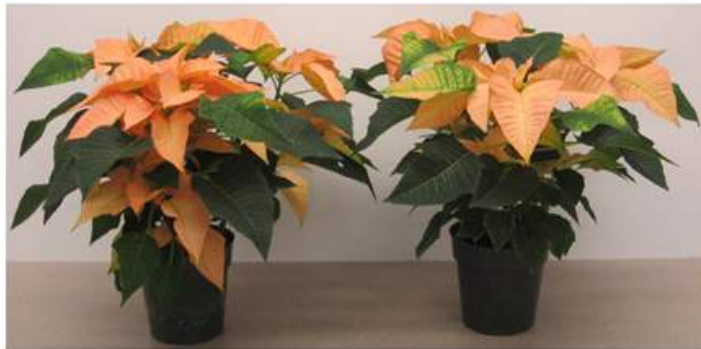
Figure 4. Poinsettia Cinnamon Star fertilized with 200 ppm N WSF (left) was a similar size as plants fertilized with 100 ppm N WSF along with 10% vermicompost by volume incorporated into the substrate (right).

slightly above neutral. For basil (4-week crop) and calibrachoa (5-week crop) plants, substrate solution EC increased with decreasing fertilizer rate and after two weeks of growth, the EC decreased. Macro and micronutrient concentration in substrate and tissue samples decreased with decreasing fertilization rate. Based on tissue analysis, results of this study indicate that basil and calibrachoa can be grown in a substrate amended with 10% vermicompost with liquid fertilization maintained between 50 to 200 ppm N to maintain sufficient nutrient levels in foliage.