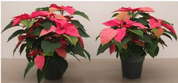
Figure 3. Poinsettia Mars Pink fertilized with 200 ppm N (left) or 100 ppm N (right) of 20-10-20 WSF.