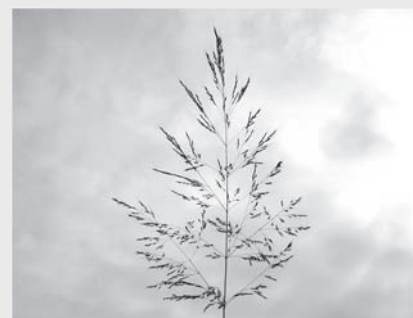
Open-branched, reddish panicle