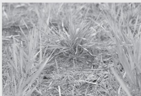
Tillering of windgrass in wheat