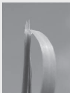
Jagged membranous ligule