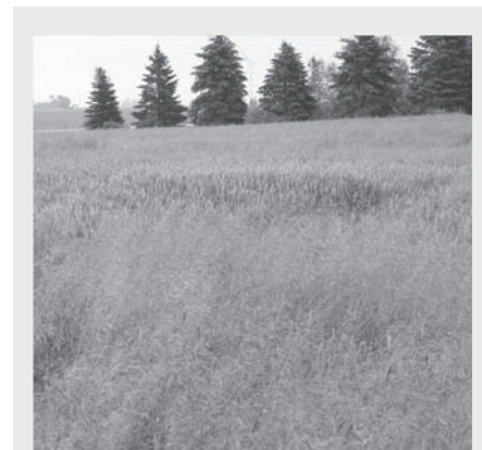
Windgrass in a Michigan wheat field