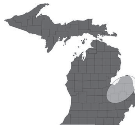
Common distribution of windgrass in Michigan