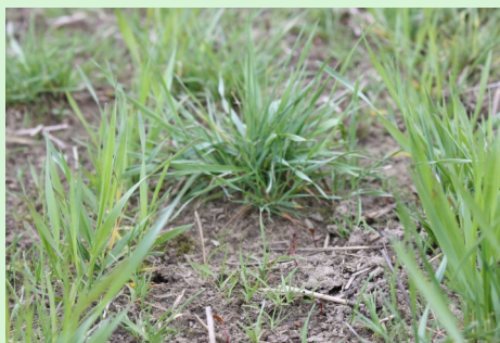
Tillering of windgrass in wheat