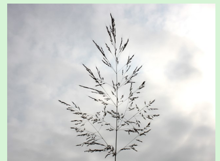
Open-branched, reddish panicle