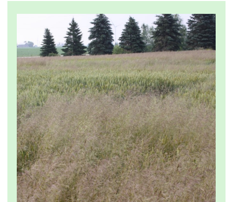
Windgrass in a Michigan wheat field

Common windgrass ( Apera spica-venti L.) is a winter annual grass species that has become more of a weed problem in winter wheat production. In the past the distribution of common windgrass in Michigan has been limited. However, over the last several years this weed has been reported in several counties. Management of this weed can be difficult because the emergence pattern and growth closely coincide with winter wheat, and the availability of selective herbicides is limited.