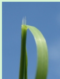
Jagged membranous ligule