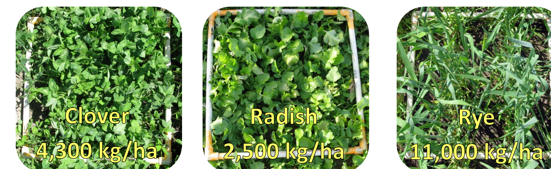
Figure 4. Samples of cover crops from the satellite sites.