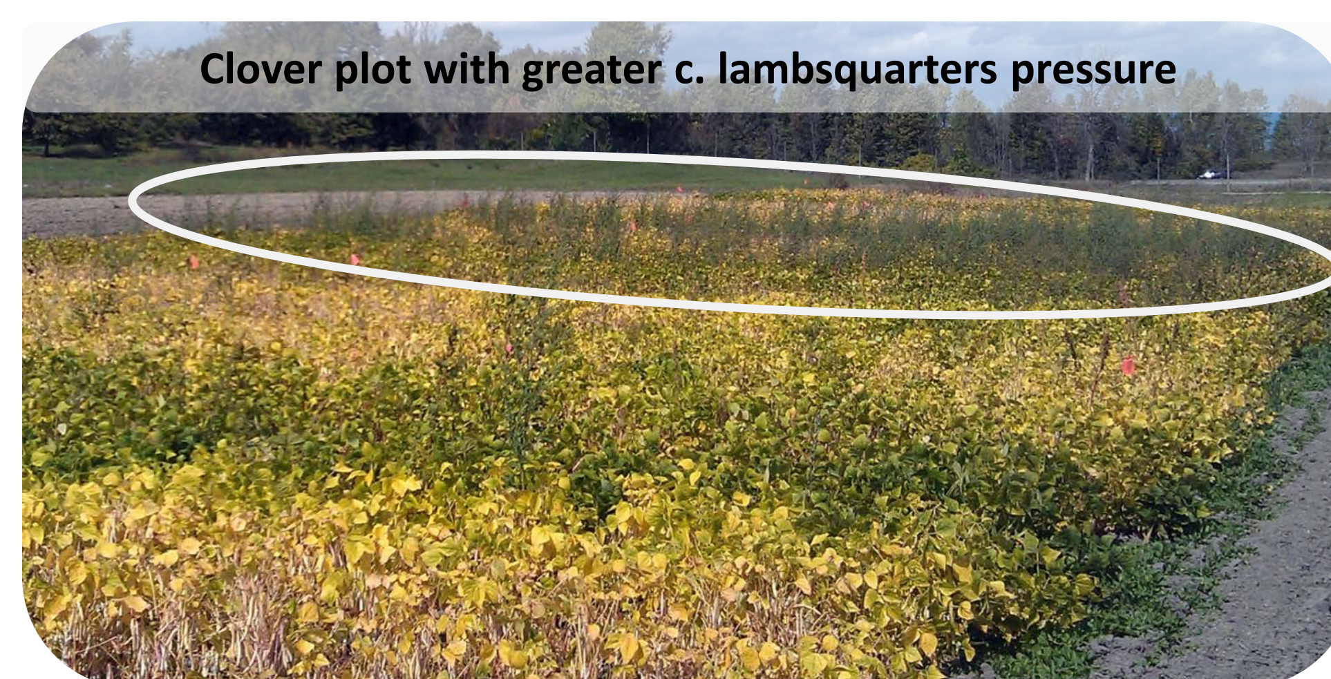
Figure 2. Common lambsquarters was clearly visible in beans planted following clover at East Lansing in 2012.