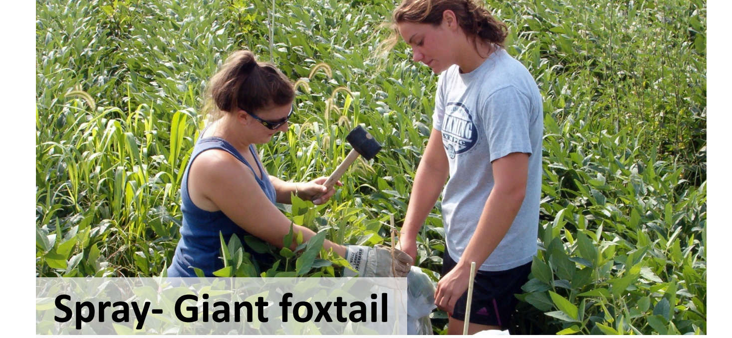
Figure 1. Termination methods: cut at base of plant (left), chopped into segments (center), sprayed with glyphosate and bagged in field (right).