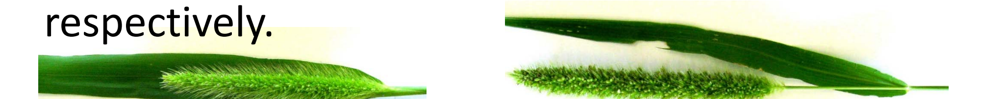
Figure 2. G. foxtail flowering stages in MI (left) & DE (right).